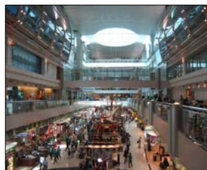
Design and Construction of the Sheikh Rashid Terminal, Dubai International Airport