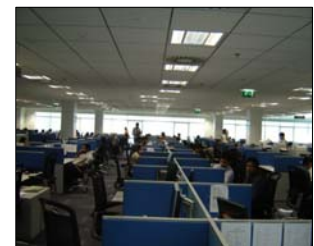
ABN AMRO Bank's Operations Offices at DOZ, the First LEED certified Commercial Interiors Project in the Middle East