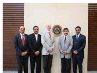
Wafi City DCCP One LEED Gold Award, the First LEED Green Building in Dubai, UAE and the Middle East